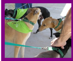
Are we done yet? Pensacola, Fl Books A Mil-