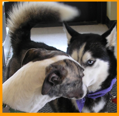
I love your eyes Petsmart Pensacola, Fl