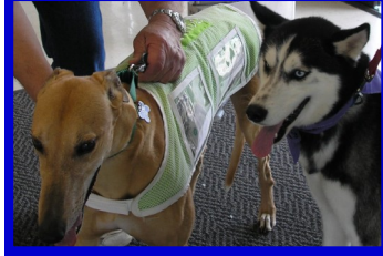
Your eyes are too scary